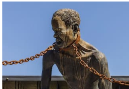
Cultural Enrichment Visiting Museum and Memorial