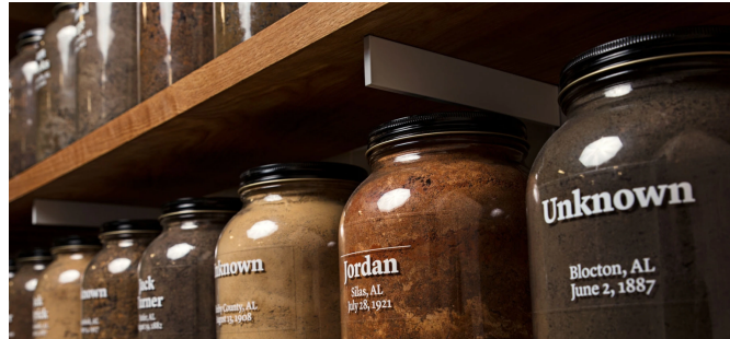
Reckoning with a Terrible Legacy Soil Collection Project

— James H. Cone, The Cross and the Lynching Tree