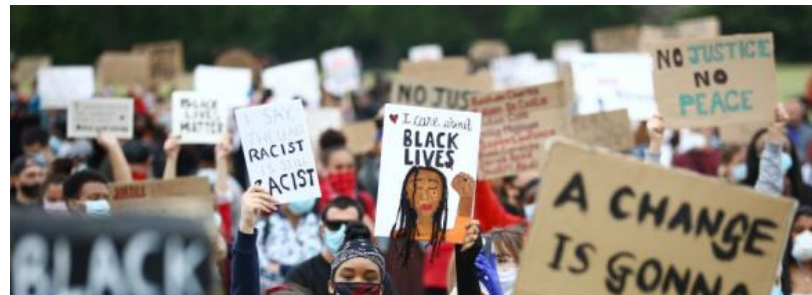
Reflecting on Today Essay Contests